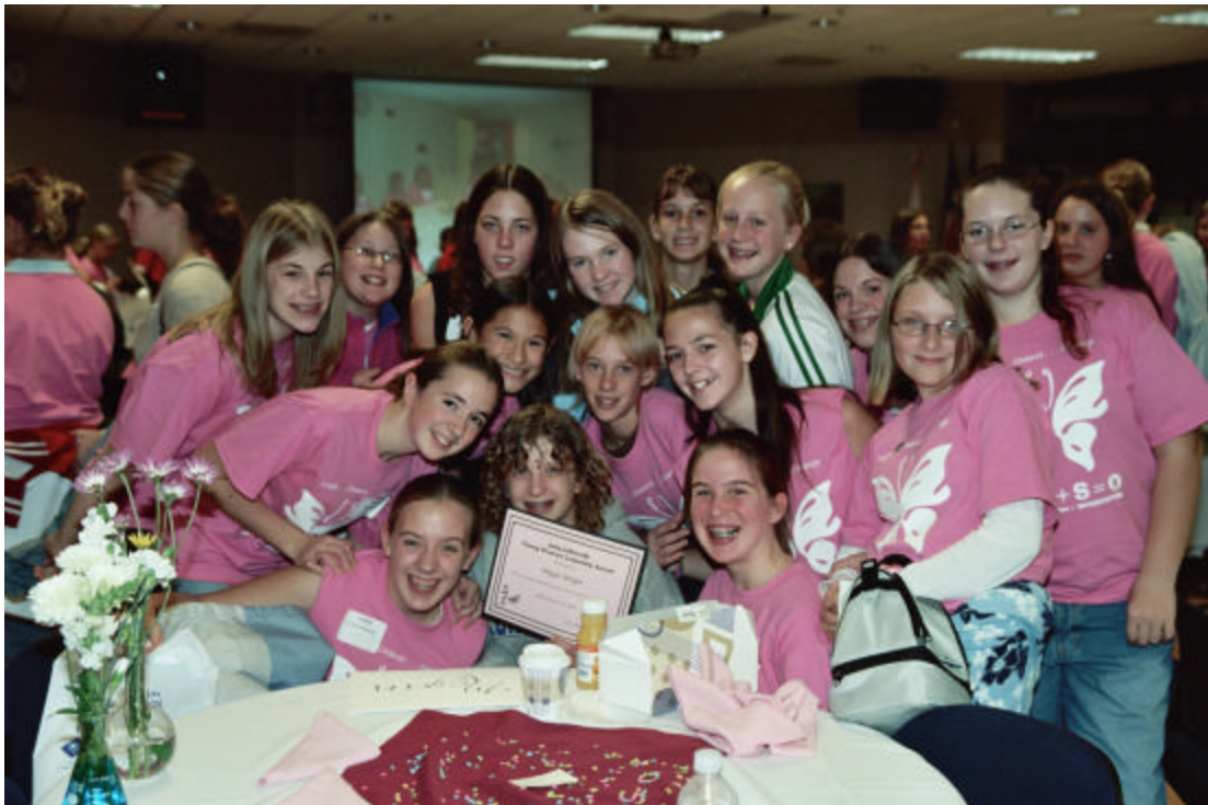
Ripon School District participants at 2005 program luncheon