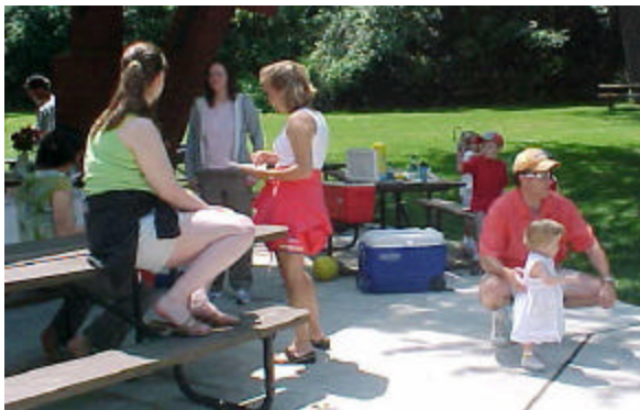
Enjoying a great day at Nagawaukee Park