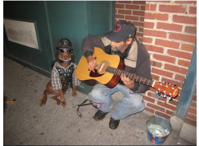
Even Dogs love music in the Music City!