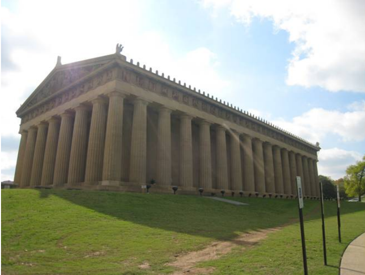
Who said the Parthenon was in Greece? No, it is in Nashville at Centennial Park!