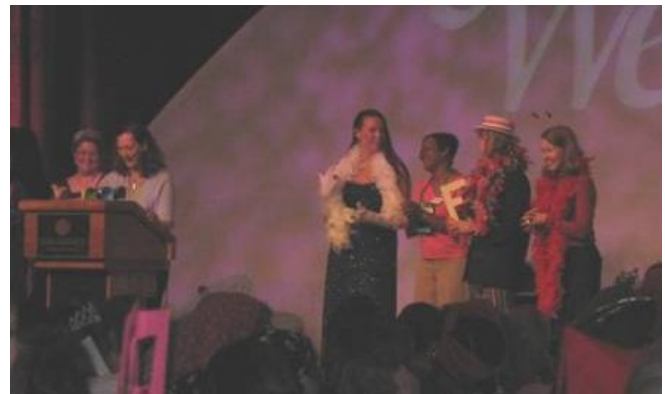
Region H was one of the four finalists, but Region D won the Spirit Award.