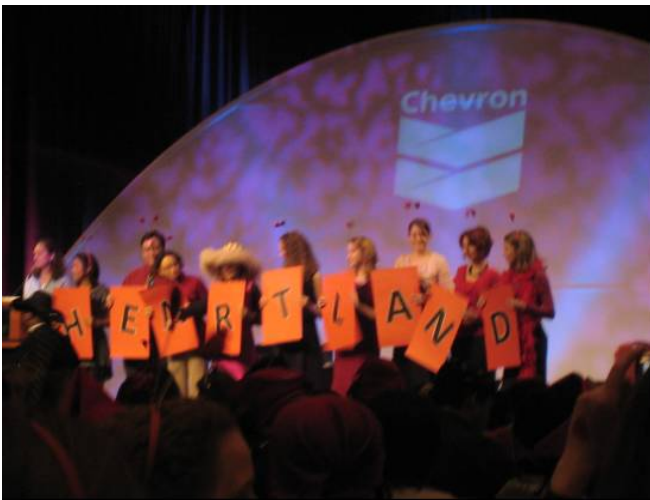
Region H gave its presentation for the Spirit Award!