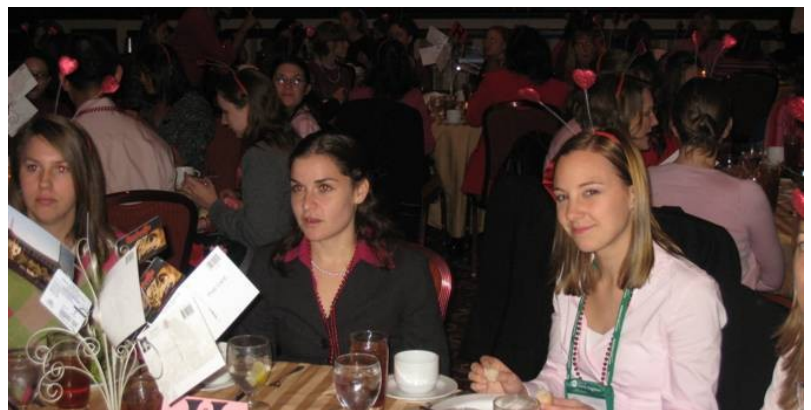
Look at all the Region H Hearts!